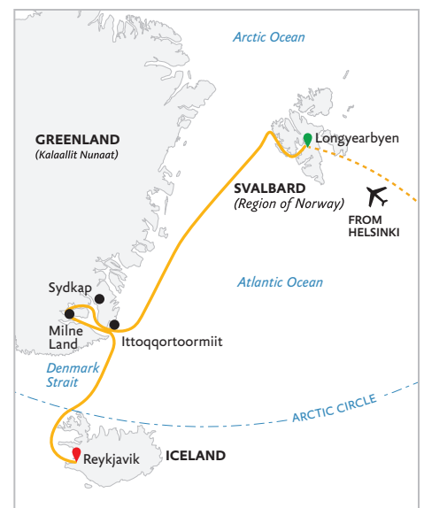
THREE ARCTIC ISLANDS: Iceland, Greenland, Spitsbergen Onboard the Ocean Explorer ——— Flight from Helsinki - - - - -

Exploring Spitsbergen, the largest island of the Norwegian Svalbard archipelago, rewards you with austere beauty and opportunities to spot its abundant wildlife. Here, you'll visit spectacular glacier fronts and tundra in full bloom, with walrus, polar bears and Svalbard reindeer amongst your possible wildlife sightings. Birders will be thrilled to see Arctic terns, skuas, Brünnich's guillemots, black-legged kittiwakes and ivory gulls. If conditions allow, you could sail within 10 degrees of the North Pole!